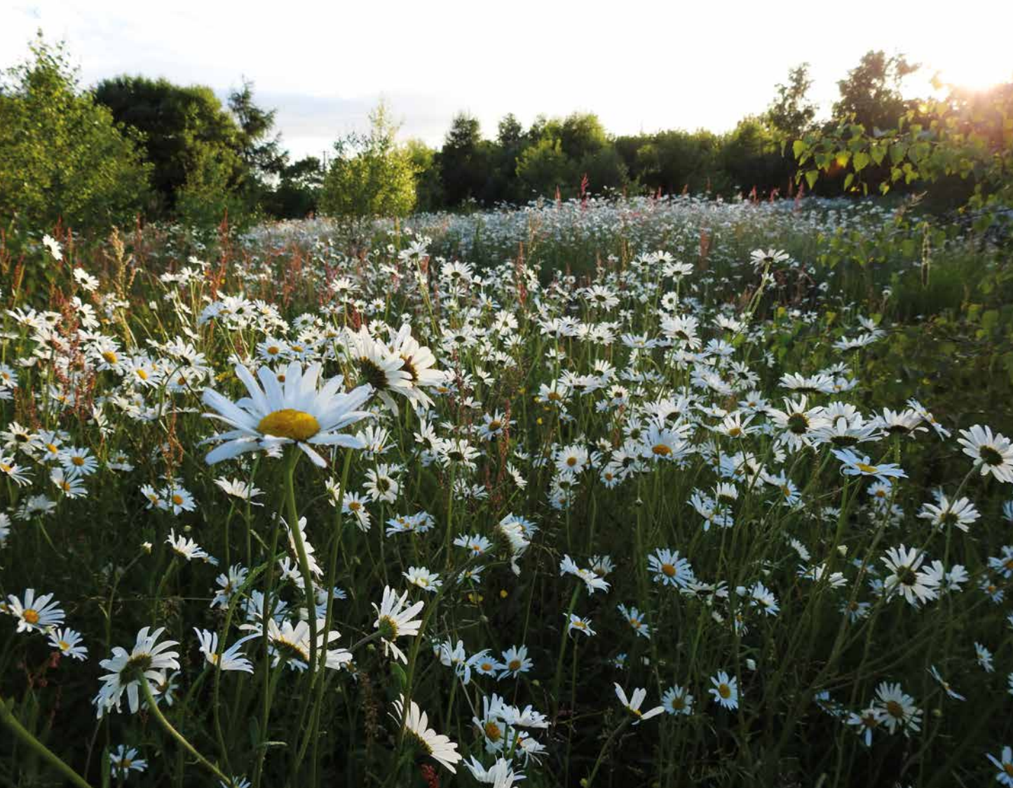
Figure 3. Oxeye daisies ( Leucanthemum vulgare ) and common sorrel ( Rumex acetosain ), Tarbock Green, Merseyside, June 2017.

and fragmented as this requires high sampling intensities to discern biodiversity trends from natural variability. These types of environment are some of the most common for biodiversity projects as they tend to occur close to human settlements or in geographically complex areas.